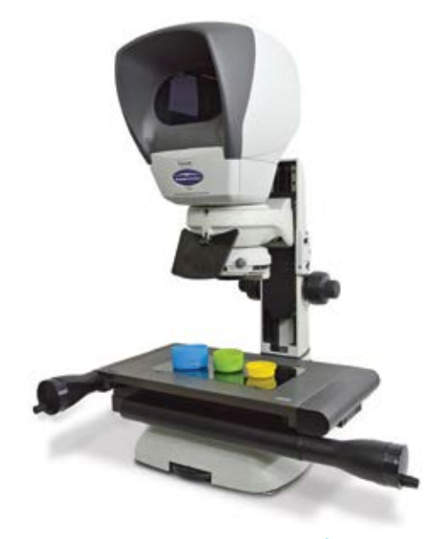
Find out more: www.visioneng.com/swiftproelite