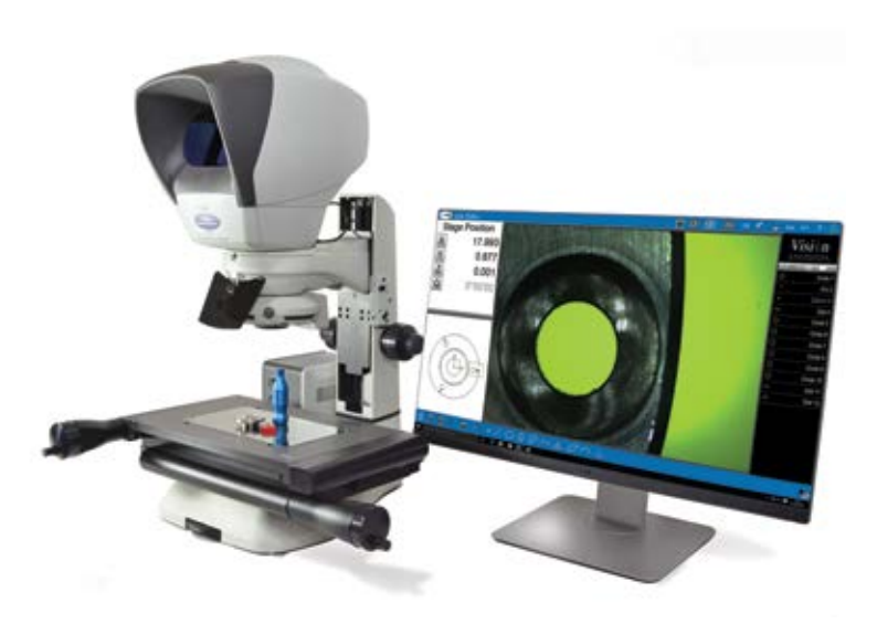
Find out more: www.visioneng.com/swiftproduo