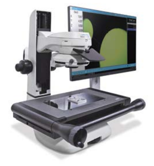
Find out more: www.visioneng.com/swiftprocam