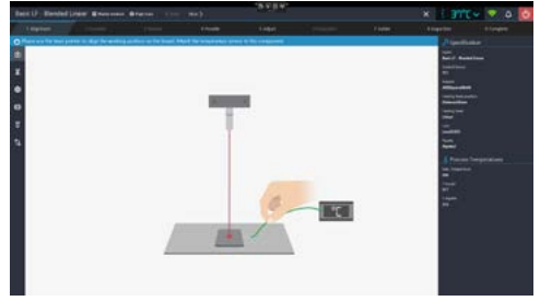
HRSoft 2 with integrated user guidance.

364 741 - 10/2019 | subject to change | © Ersa GmbH