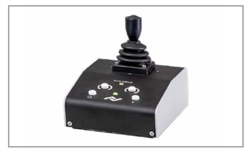
Motorized X-Y adjustment and component rotation.