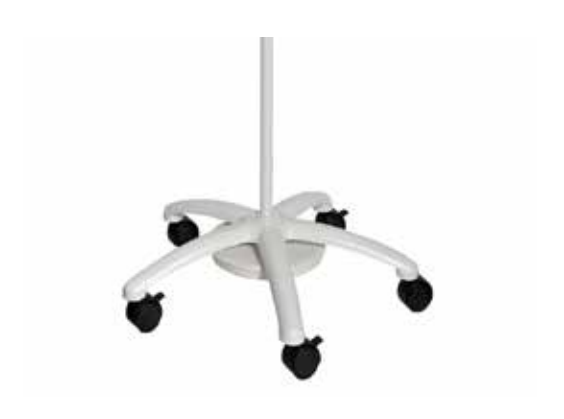
Floor Stand (Trolley) With Extra Weight