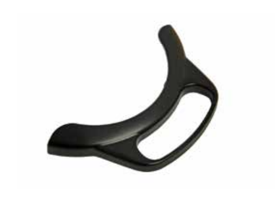
KFM LED Handles