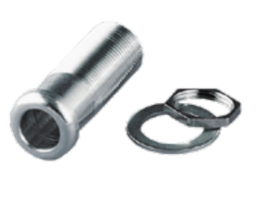
TE Table Bushing