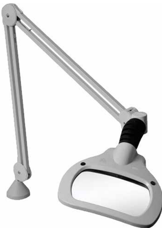
Wave LED / LED ESD / LED UV Magnification

Timer and dimming: Step dimming 0-50-100%. Selectable left / right illumination. Auto shut-off function.