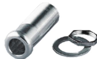
TE Table Bushing