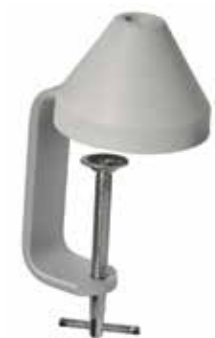
AH Mount Bracket