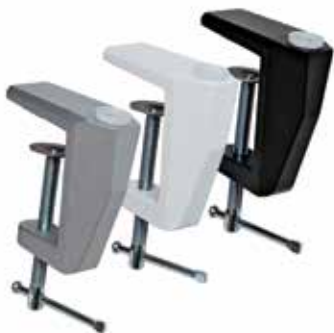
A-Edge Mount Bracket