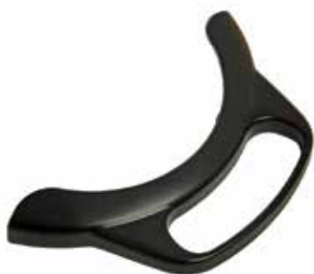
KFM LED Handles