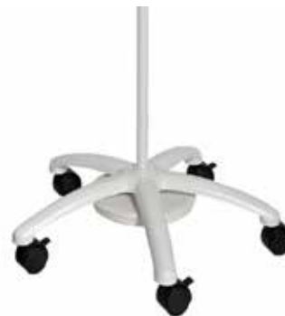
Floor Stand (Trolley) With Extra Weight